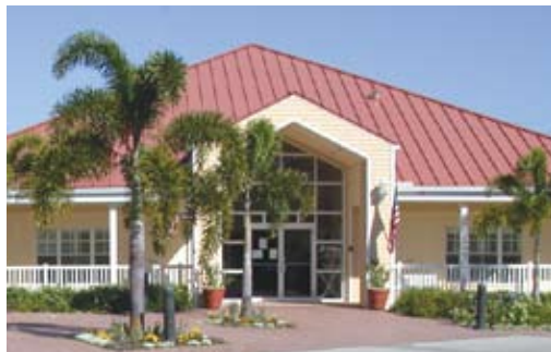
Center for the Arts of Bonita Springs’ Main Entrance

We hope you choose to join us and enjoy all we have to offer.